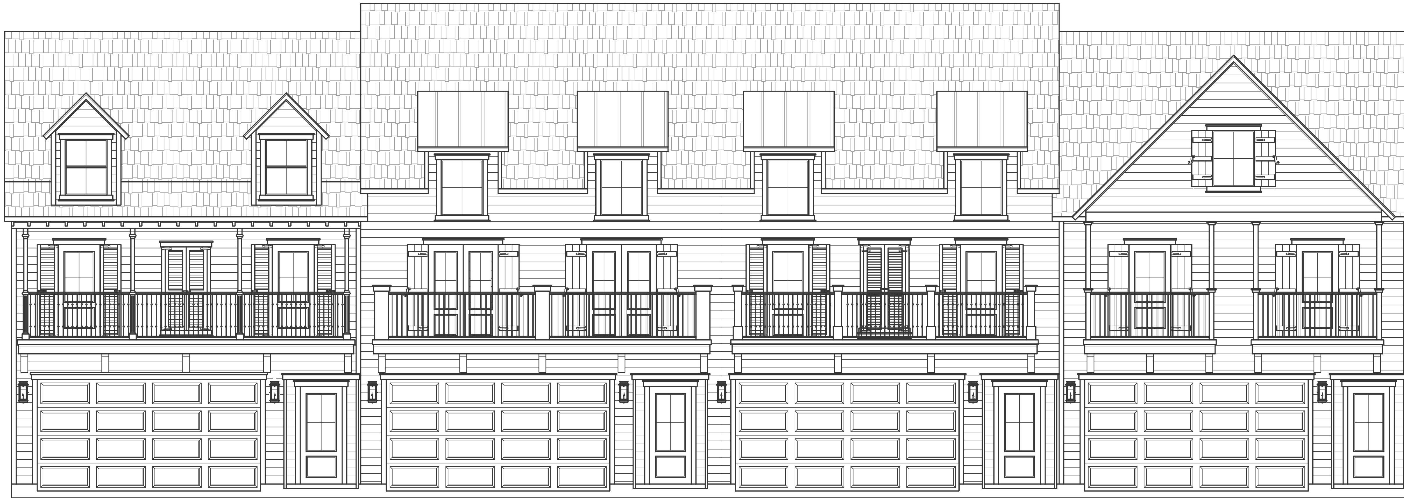
FRONT ELEVATION "A" SCALE: 1/4" = 1'-0"