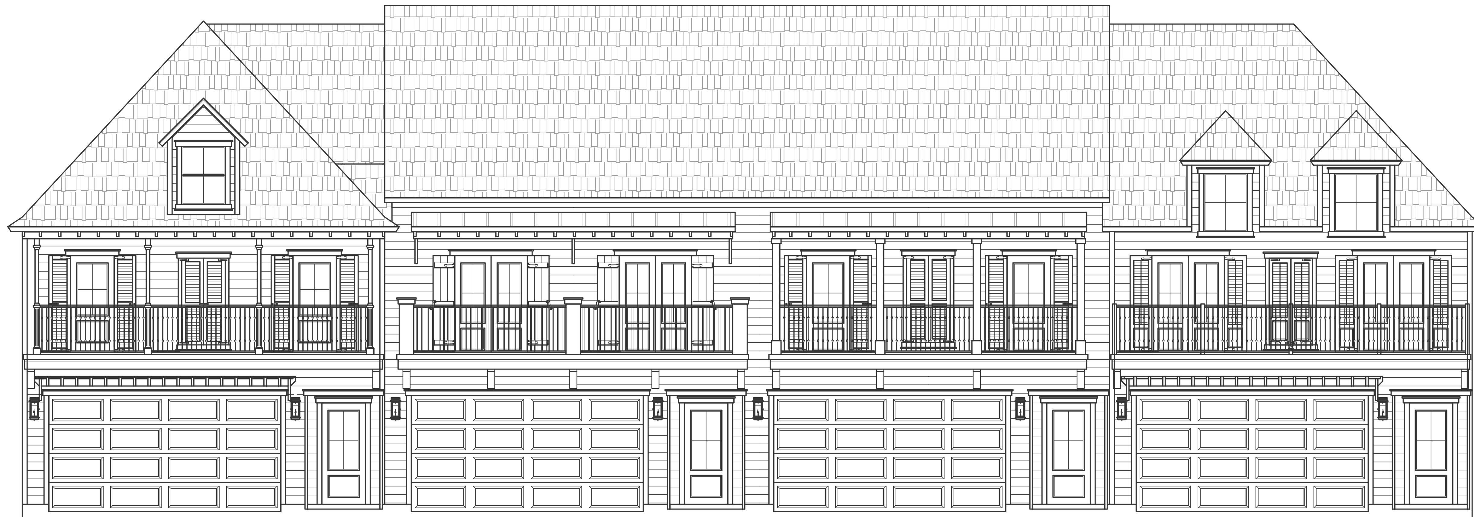
FRONT ELEVATION "B" SCALE: 1/4" = 1'-0"